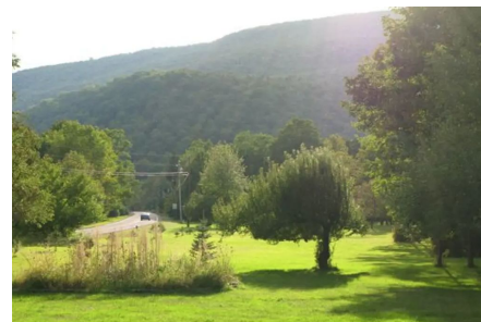
Sun sets at Maple Tree Farm

Videofreex archive - In Motion Productions NYC studio